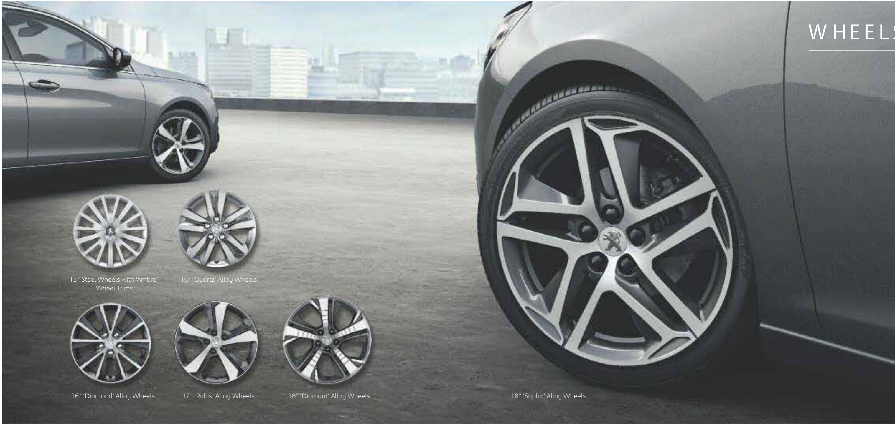
15" Steel Wheels with 'Ambre' Wheel Trims