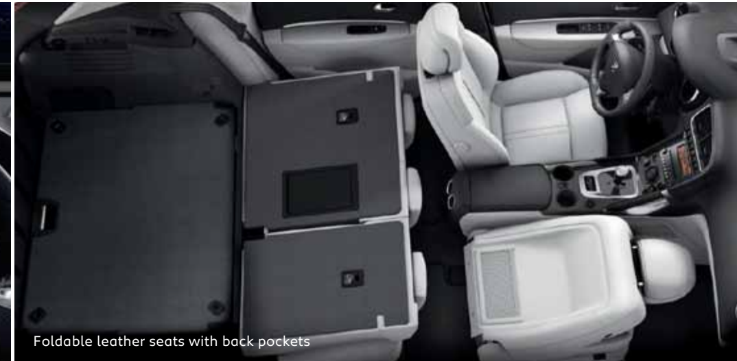
Foldable leather seats with back pockets