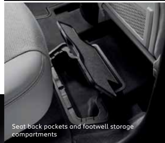
Seat back pockets and footwell storage compartments