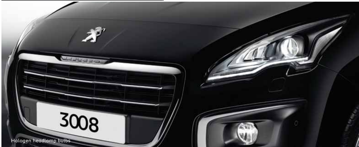
Halogen headlamp bulbs

A split tailgate and a spacious, adaptable multi-flex interior means you can load it up easily with whatever you need for your next adventure. Plenty of versatile storage and Isofix attachments make for a comfortable, safe journey for even the youngest adventurers.