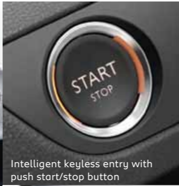
Intelligent keyless entry with push start/stop button