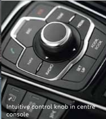
Intuitive control knob in centre console