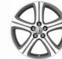
18" Aluminium Rim Style 10*