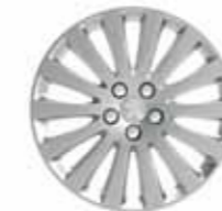
16" Hub Cap Style A*