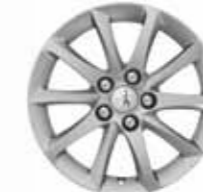
16" Aluminium Rim Style 01*