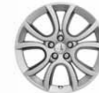
18" Aluminium Rim Style 07*