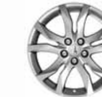
17" Aluminium Rim Style 05*