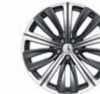
19" Aluminium Rim Style 12*