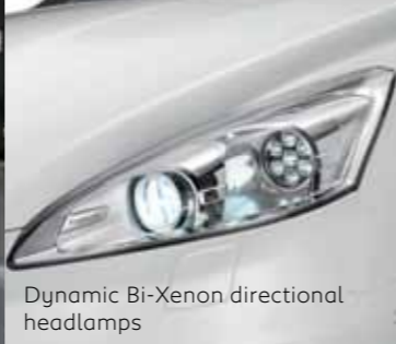
Dynamic Bi-Xenon directional headlamps