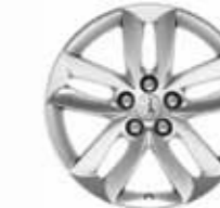
17" Aluminium Rim Style 04*