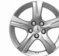
16" Aluminium Rim Style 02*