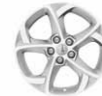
17" Aluminium Rim Style 09*